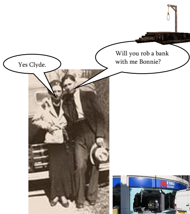
Actual photo of Bonnie and Clyde

(Bonnie and Clyde were born in Texas, but there is a town called Kent in Texas. However, there is no evidence that at some time in her life Bonnie did not live in Burton on Trent. They did not go to the gallows but were killed in a shoot out. OK so I am stretching it a bit. Why not??)